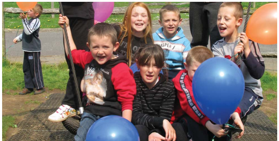
Photo – Youngsters enjoying the new park that Northbourne Action Group worked so hard to achieve over the year, with our support.

We worked with around 20 local residents' groups during the year. Some are recognised by us formally, but most are informal groups that you have set up to run events or community activities, or to look out for your neighbourhood. Your groups can make an enormous difference to life at your schemes.