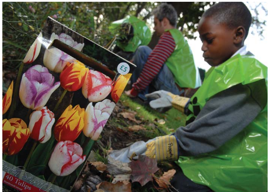
Photo – Youngsters helping to tidy up Stamford Hill Estate in Hackney.

Five London estates have been targeted so far: Stamford Hill, Hindle House and Myddleton Grange in Hackney, Royal Arsenal in Greenwich and Fieldgate Mansions in Tower Hamlets. The estates have seen some real successes and residents have played a key role.