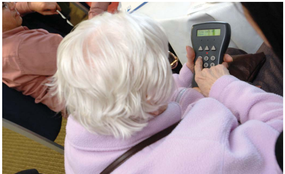
Photo below – Using a handheld device to vote on the issues at the Thames Gateway region conference in March 2009.